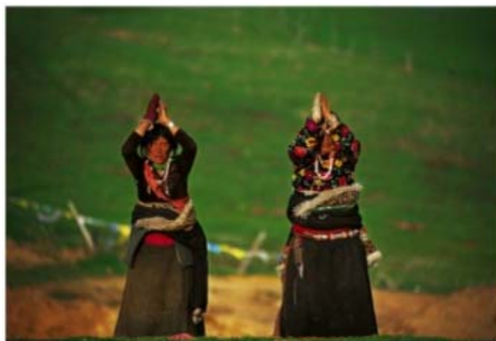
Langmusi/Tibetan women praying

Day 4 (23 Oct) Langmusi: We have a full day visiting the two Tibetan monasteries, and wander about the pretty villages. There are numerous trekking possibilities and we have the services of local Tibetans to take the group around this very untouristic area of Gansu. O/N Langmusi.